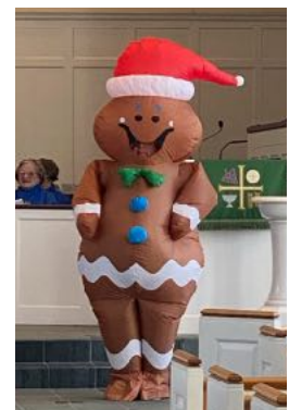
Come see Gingie at this year's cookie walk!

We also need helpers for the day-of! See the sign up sheet or call the church office.